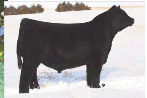
SIRE: Schilling Halas ET