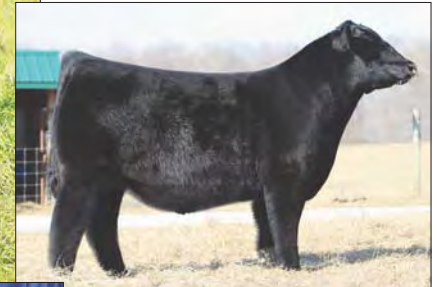
SIRE: SCC SCH 24 Karat 838