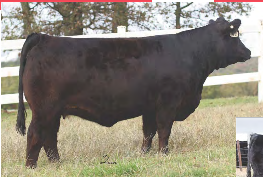
DAM: PBR Grey 9284G ET