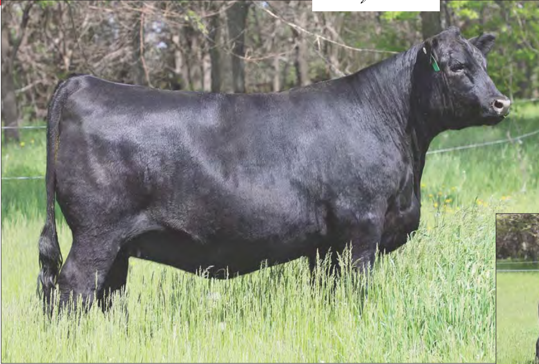
LOT 1: WULFS Jacey Rae 1168J