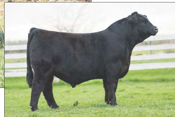
SIRE: FWLY LHC Capital ET