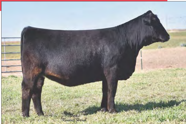
DAM: LFL Eleanor 7103E ET