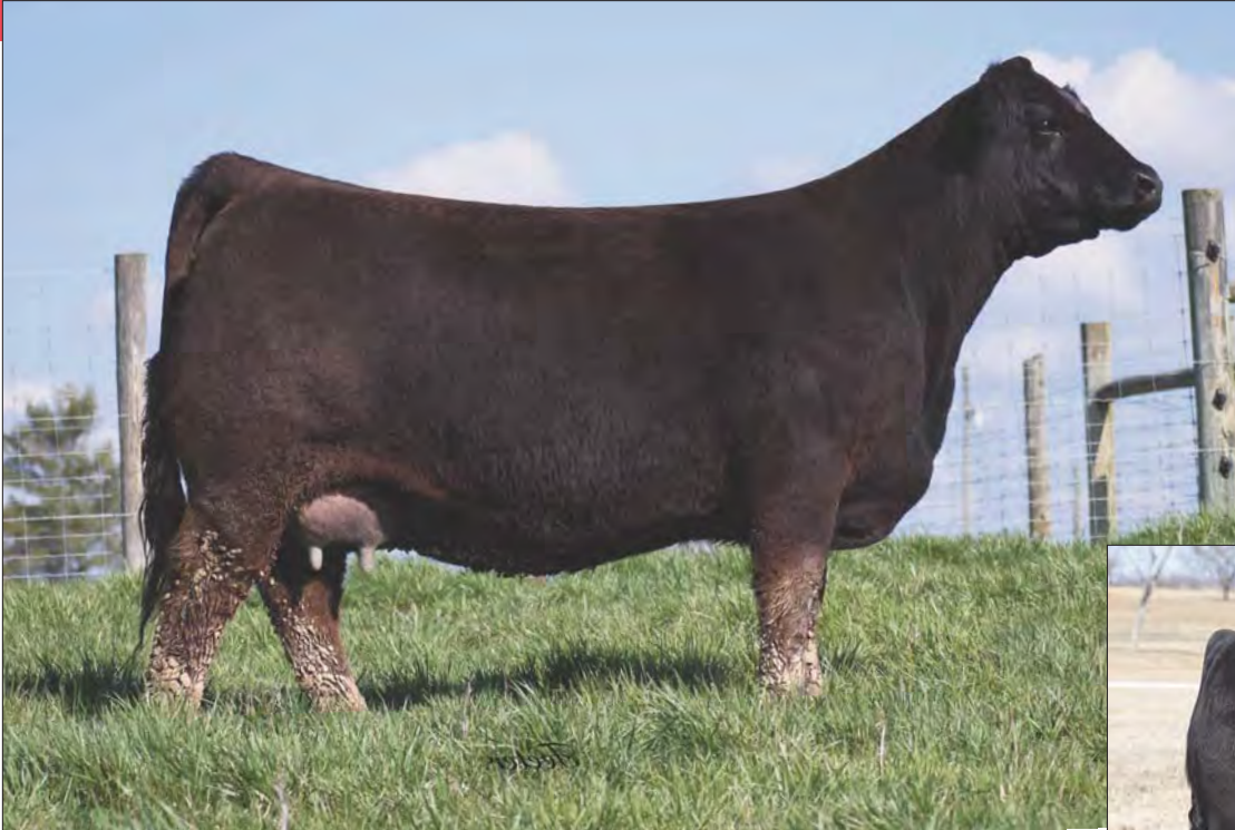
DAM: AUTO Fly Girl 252F