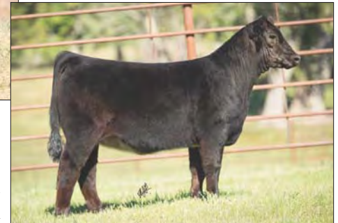
FULL SIB IN BLOOD TO EMBRYOS: CELL Jade 1157J purchased by Sarah Sullivan, Dunlap, IA