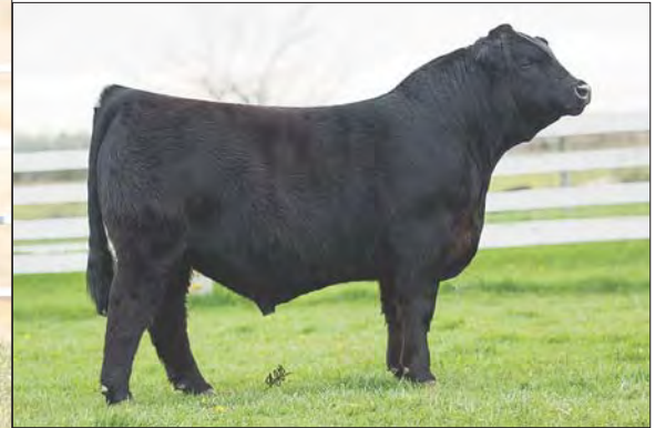
SIRE OF LOT 17A: FWLY LHC Capital ET