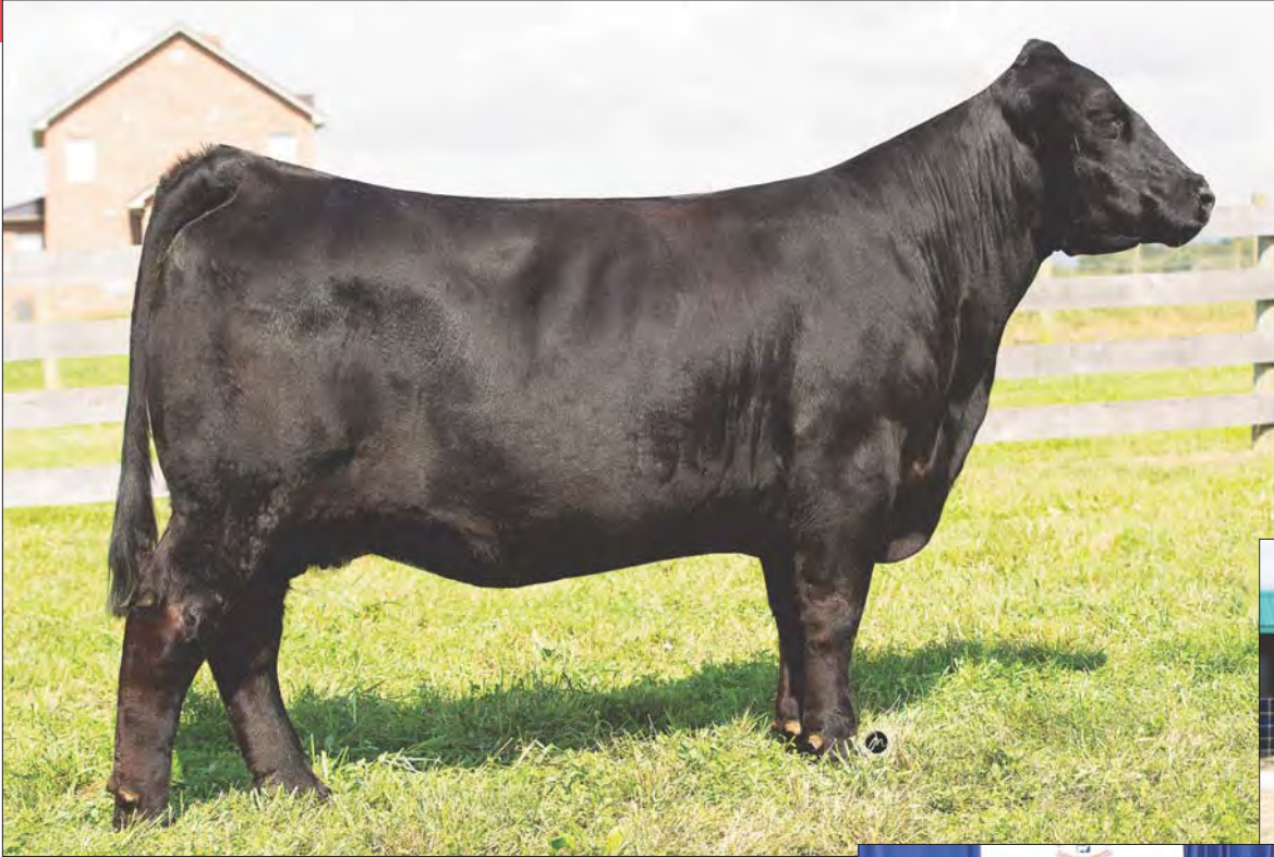
DAM: AUTO Peyton 206Y