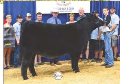
MATERNAL SIB TO EMBRYOS: TASF Envy 161E