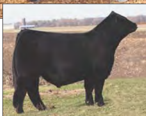
SIRE OF 32B: SSTO Guns N Roses 9408G