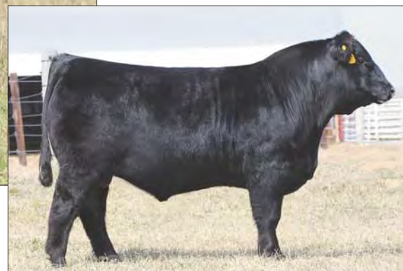
SIRE: CELL Envision 7023E