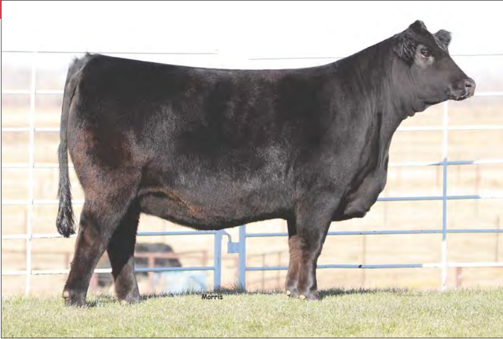
DAM: MAGS External Flame 580E