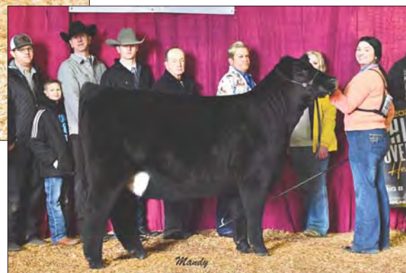
FULL SIB TO EMBRYOS: PA Cattleman's Spring Spectacular Supreme Champion Female, Ring A and Central PA Showdown, Supreme Champion Female