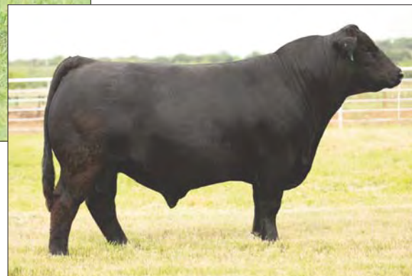
SIRE: SSTO Fortitude 8914F