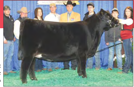
DAM: LLJB Absolute Style 3056A