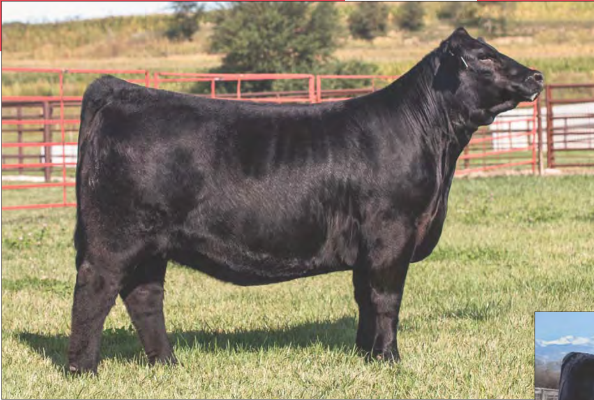
DAM: KLS SULL Gucci 205G ET