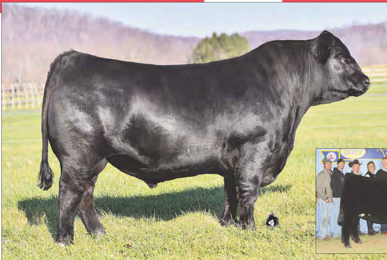
SIRE: COLE Genesis 86G