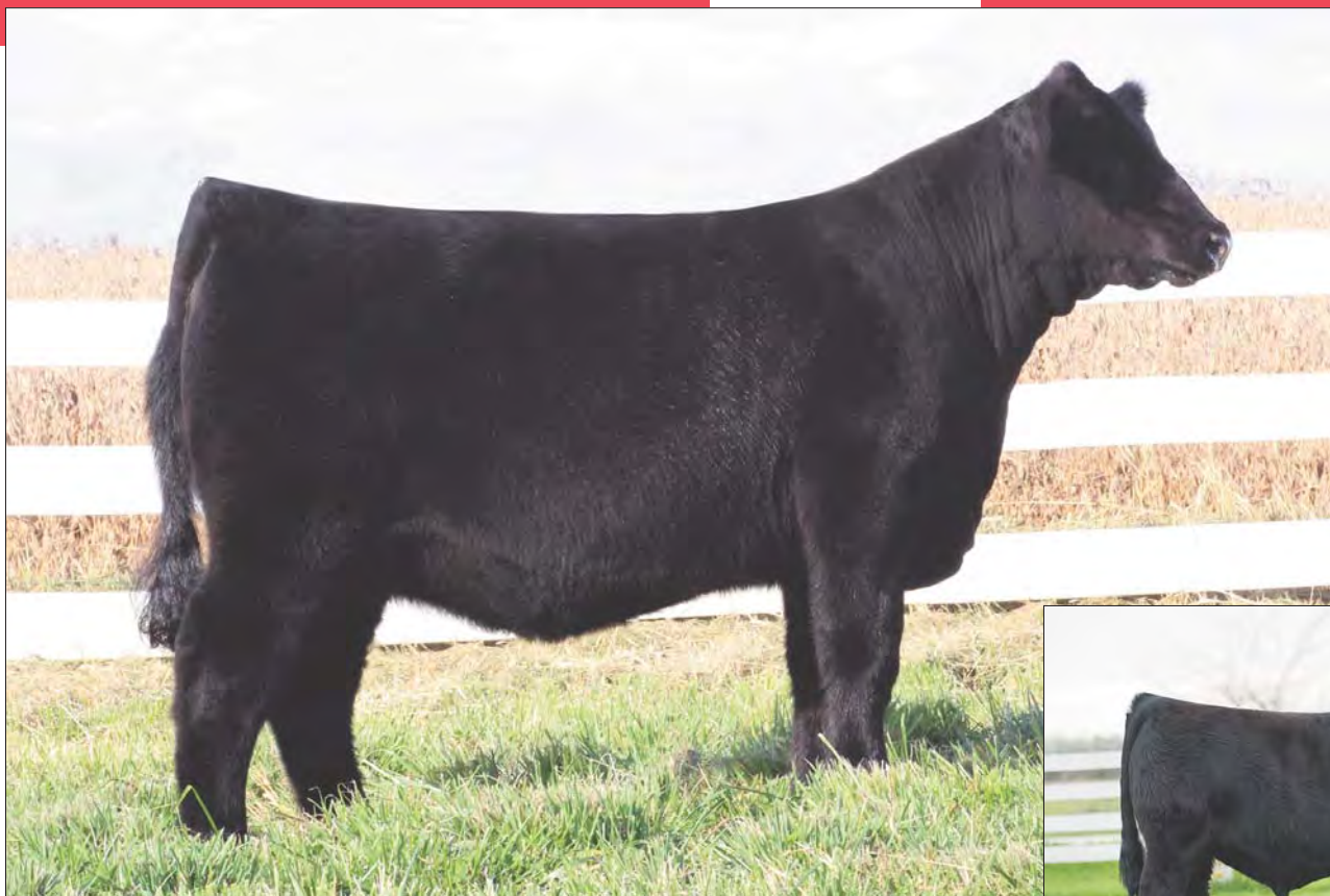
DAM: ATAK Honey ET