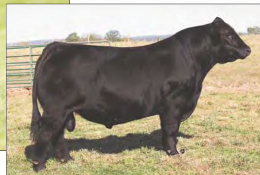
SIRE: TASF Crown Royal