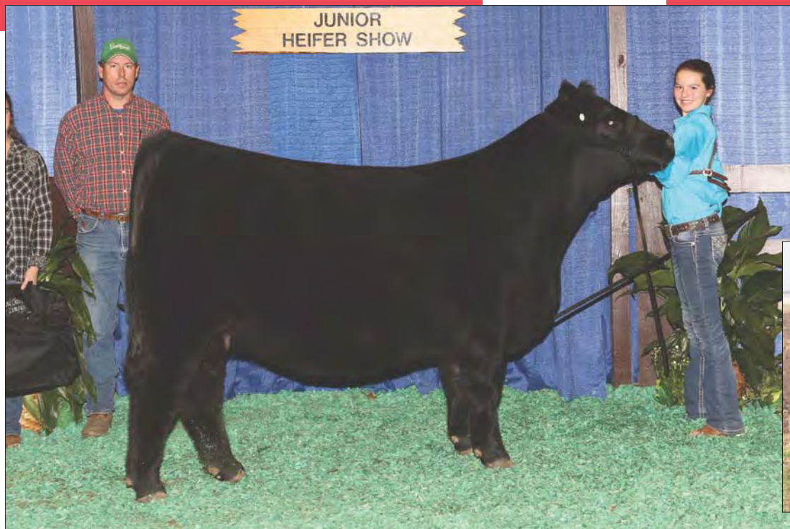
DAM: MKJM Evergreen 703E