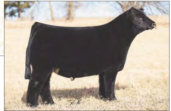
SIRE: Ratliff Jump Start 340J ET