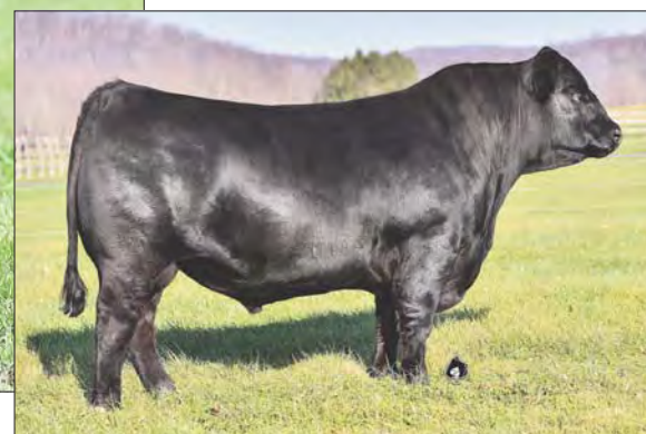
SIRE: COLE Genesis 86G