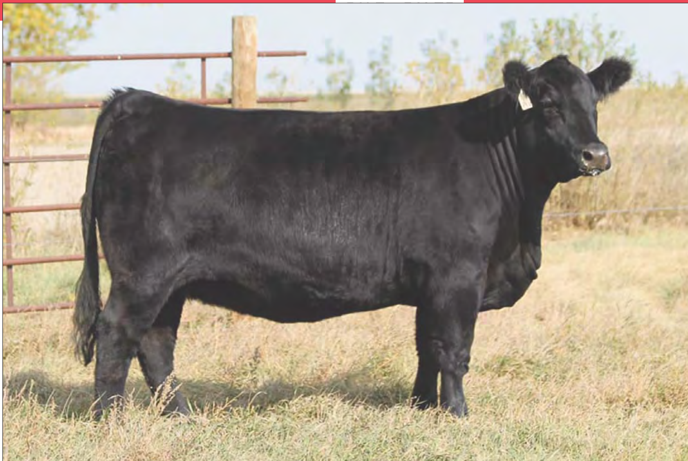
DONOR: B-Bar Georgina 17H