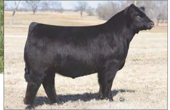
SIRE: ATNF Higher Revenue JCLC 013H