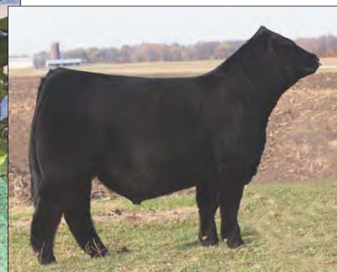
SIRE: SSTO Guns N Roses 9408G ET