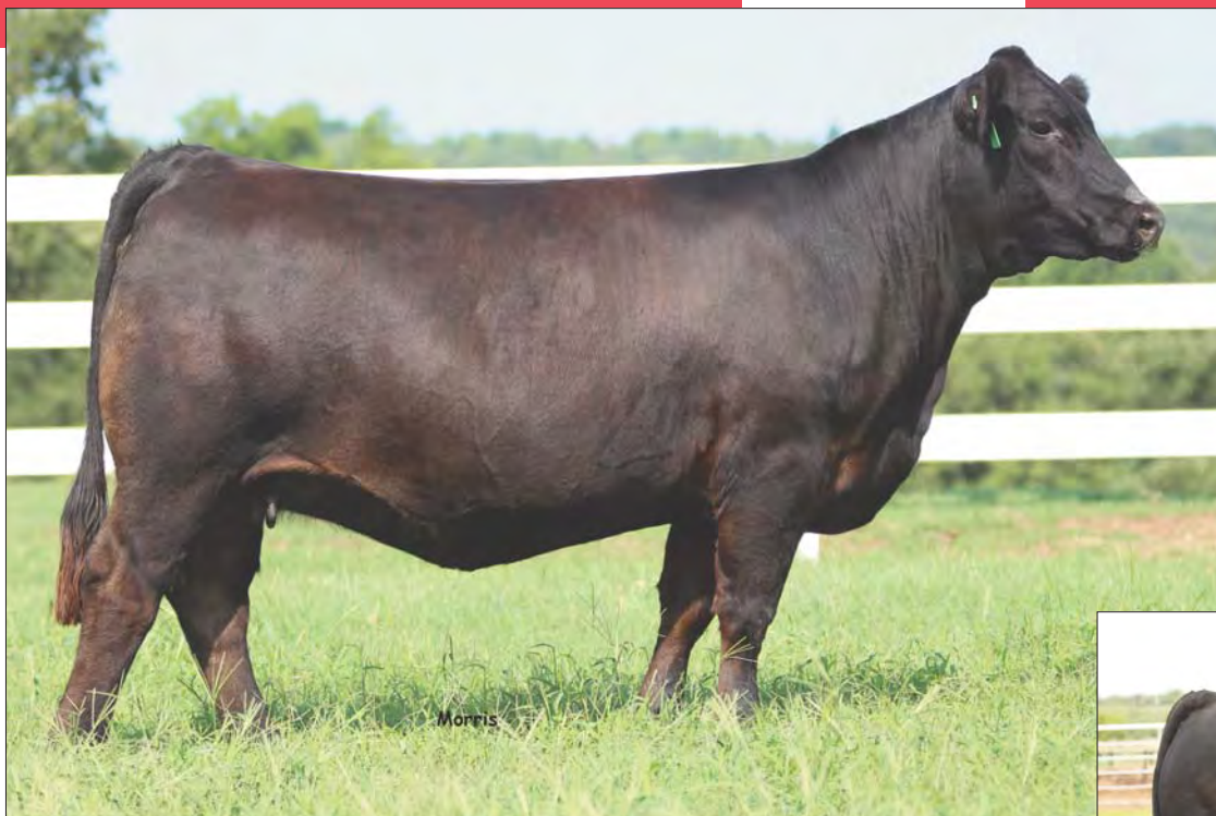
DAM: Dark Sunshine