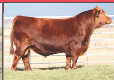
SIRE OF 32C: Wulfs Emprize 2424E