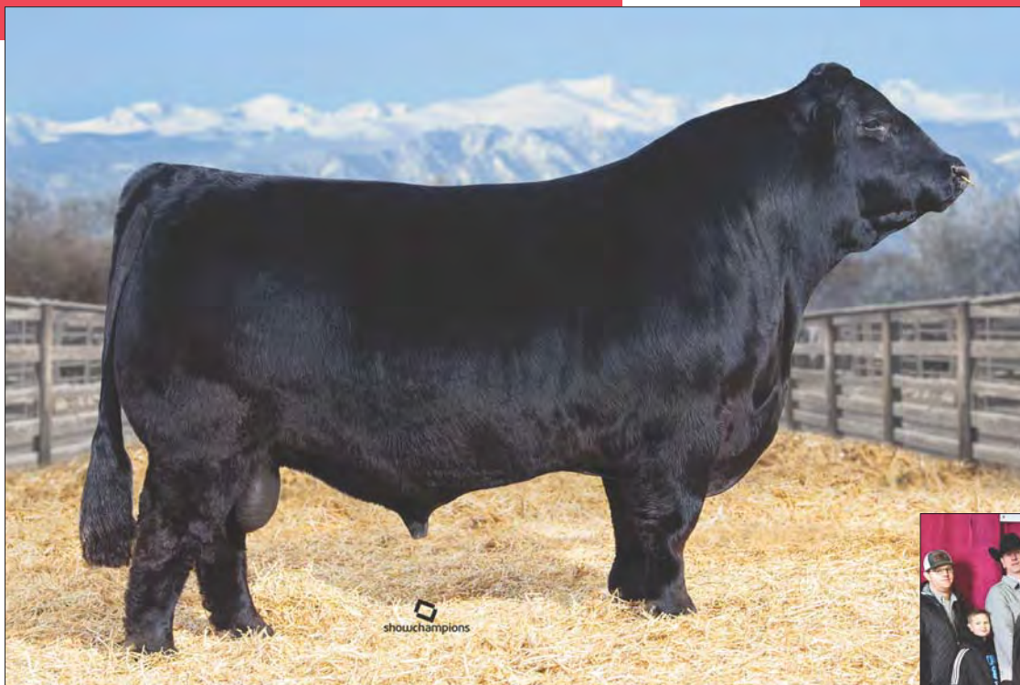
SIRE: ELCX Kings Landing 599D ET