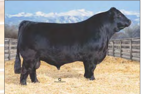
SIRE: ELCX Kings Landy 599D ET