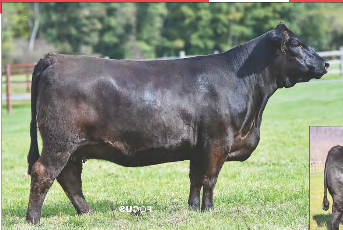
DAM: TMCK Gazpacho 743G