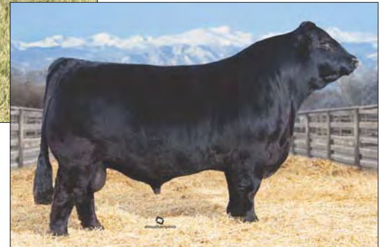
FULL SIBS IN BLOOD: ELCX Kings Landing

- IVF Embryos - FULL SIB IN BLOOD TO ELCX KINGS LANDING