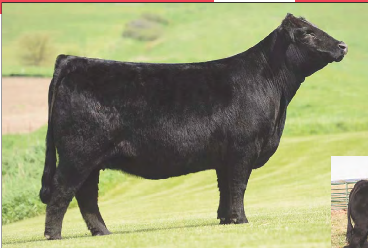
DAM: WLR Prada