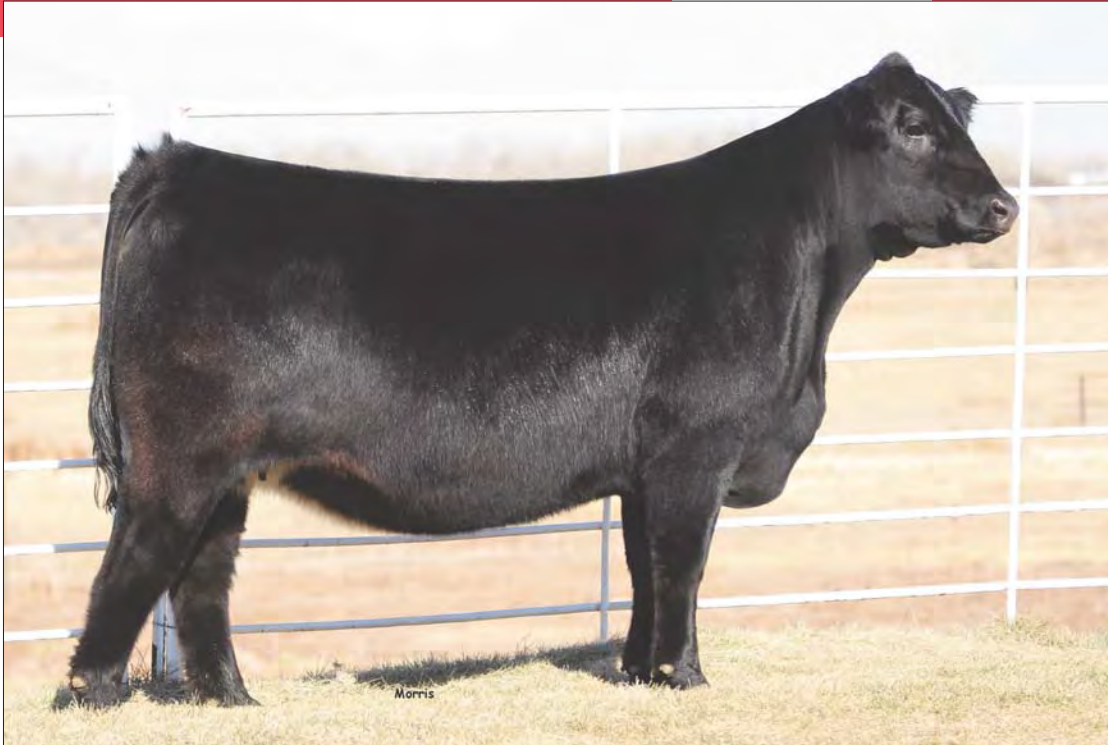
DAM: MAGS Heiress 1607H ET