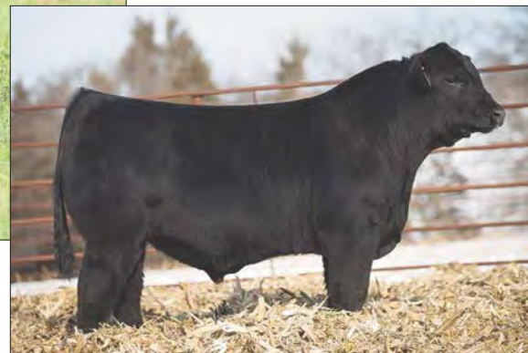
SIRE: CELL History Maker 0256H ET