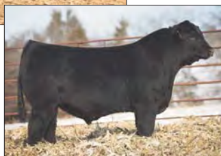
SIRE OF 32C: CELL History Maker 0256H