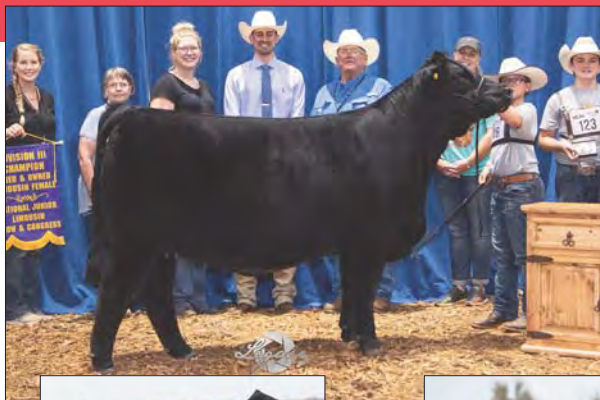
DAM: LFL Fiesta 8126F