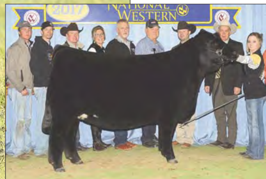
FULL SIB TO DAM: Riverstone Charmed